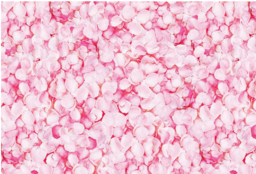
DP23847-26 | Roses | Pink