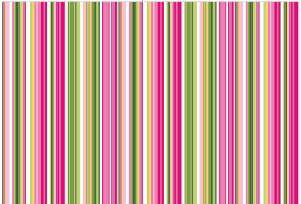
23850-10 | Stripe | White Multi