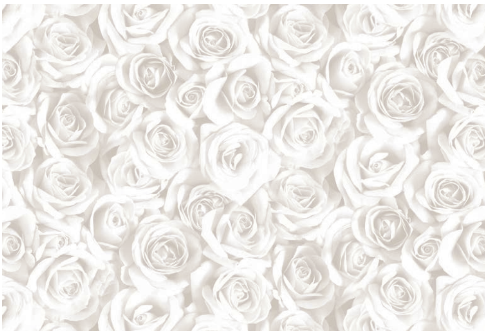
23846-10 | Roses | White