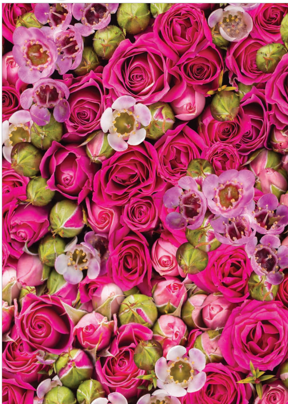
DP23844-28 | Feature Mixed Roses | Dark Pink Multi