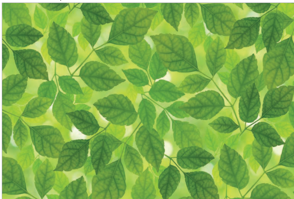
DP23849-74 | Leaves | Green